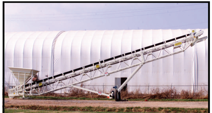
MARCO RADIAL STACKER